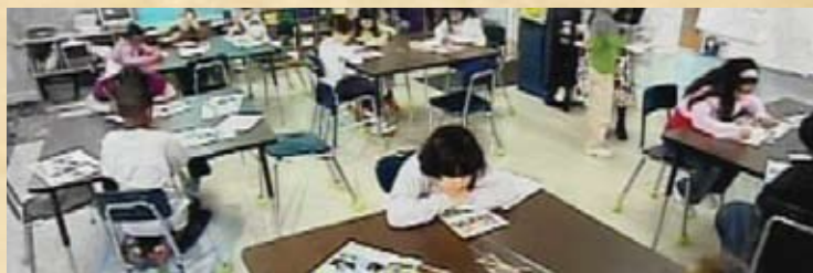
Third graders at Club Boulevard Elementary School in Durham were featured in the PSA.

PRStreet provided press materials and media relations for the campaign. www.abc11tv.com