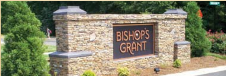
The entrance to Bishop's Grant incorporates more landscaping than required by the town of Wake Forest.

PRStreet client Contentnea Creek Development Company of Raleigh has been awarded a 2007 Green Medal of Excellence by the Wake Forest Urban Forestry Board . The award recognized Contentnea Creek's work in the Bishop's Grant community which exceeded the town's development requirements in providing more open space, conservation easements, and additional landscape buffers and street plantings. Bishop's Grant was nominated by the Urban Forestry Board, and was presented with the award during the 29th Arbor Day celebration in Wake Forest on March 22.