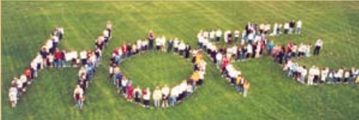
Participants gather to spell out the message of "hope" during this year's CAM Relay for Life event.

More than 1500 people participated in the 10th annual Cary/Apex/Morrisville (CAM) Relay For Life held in April and the result was a record amount of money raised and a record number of participants. The event took place at Cary High School in Cary, NC. The 1530 participants on 79 teams raised $236,046 during the event, which is the most raised among the seven Relay for Life events in Wake County.